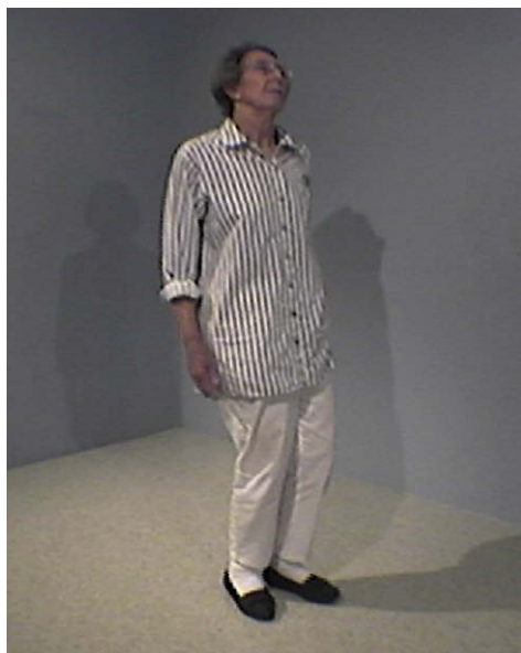
Fig. 4. Patient's camptocormia markedly improved after treatment with BoNT (Botox® 200 U in each rectus abdominus).

is held in a postural position, the so called re-emergent tremor, that often interferes with the ability to hold objects such as newspaper or a cup, and is more troublesome for patients with PD than the typical rest tremor (Jankovic et al., 1999). While levodopa and other anti-PD treatments are usually effective in improving this cardinal feature of PD, other treatment such as BoNT and deep brain stimulation must be considered in patients who fail to obtain satisfactory relief (Diamond and Jankovic, 2006).